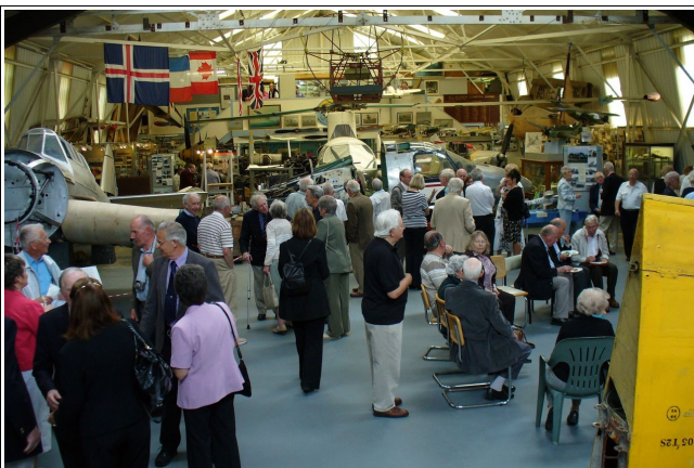
A good crowd enjoying the new spaciousness...