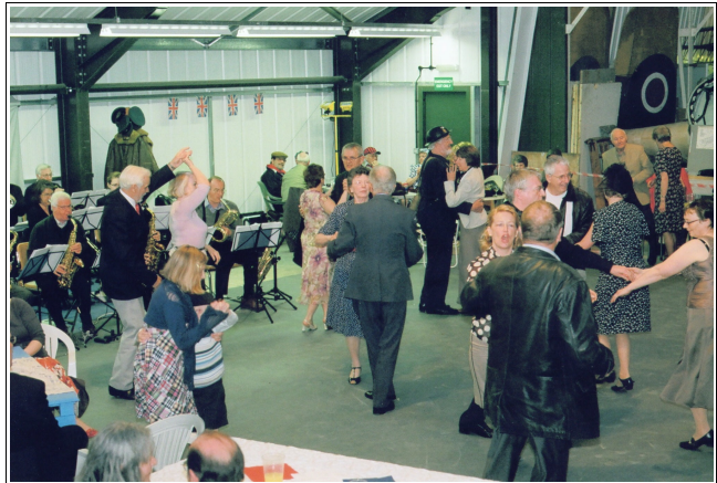
Pre-official opening Grand Dance