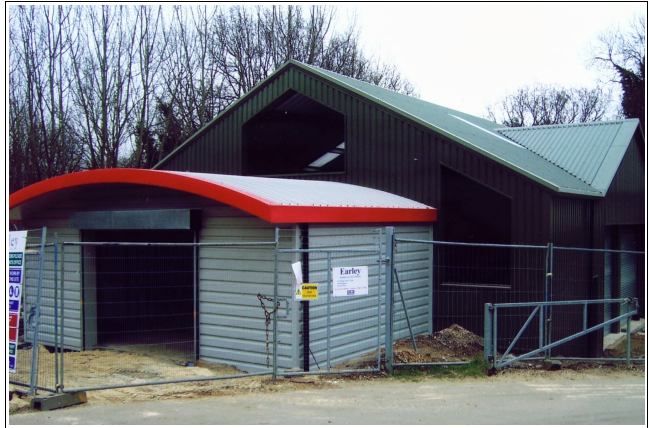
Almost finished