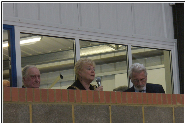
Official opening